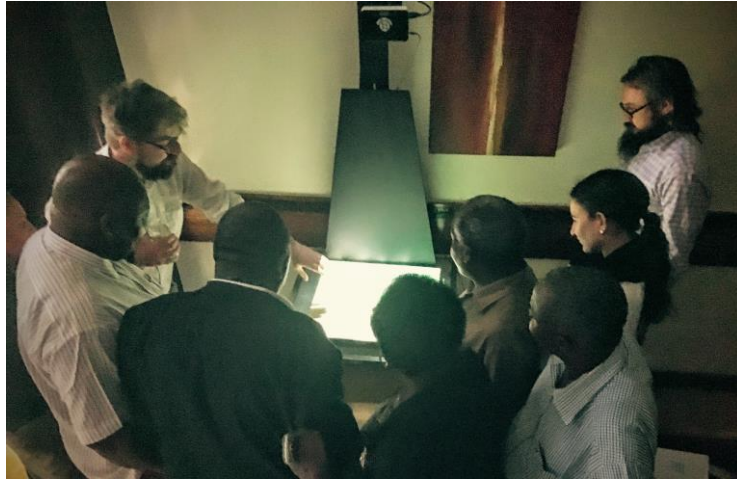
Figure 5. Use of a mobile PARM installation to aid Dar es Salaam city council and World Bank members in discussions of population mobility patterns in Tanzania.