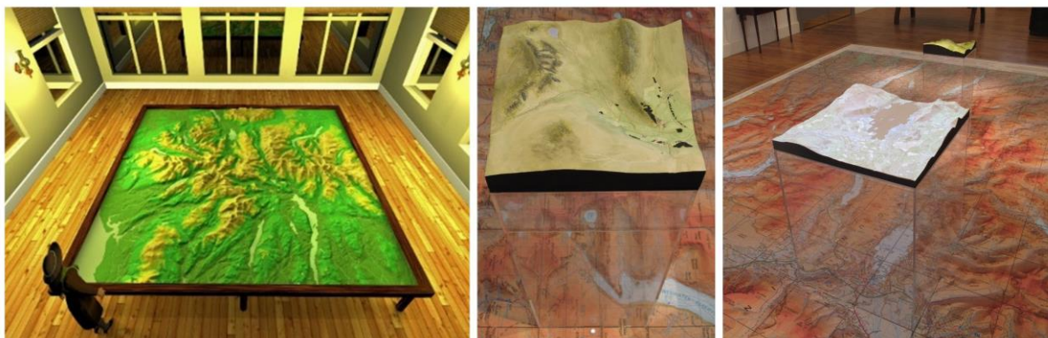
Figure 3. [Left] Reconstruction of Mayson's Ordnance Model of the Lake District from 1875. [Centre] Reconstructed tile over floor map. [Right] PARM display over floor map.

Another opportunity to explore public interaction with PARM came with an exhibition at Keswick Museum & Art Gallery in 2015 which attempted to convey the size and detail of Mayson's Ordnance Model of the Lake District from 1875 (Figure 3, left), the negative moulds from which had been recently recovered. Moulds were scanned and digitally inverted and several replica tiles constructed and placed over a floor map to the scale of the whole model (Figure 3, centre). A PARM installation was used in this way acting as a 'You Are Here' map centred on Keswick (Figure 3, right). The affordance of completely free movement around the models to promote close inspection and wider views was clearly evident.