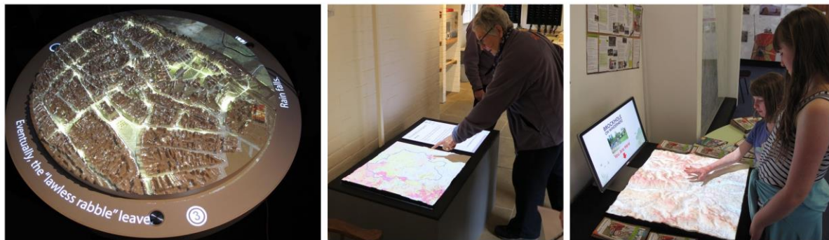
Figure 2. [Left] Nottingham Riots 1831 installation. [Centre] Southwell Workhouse National Trust installation. [Right] Lake District National Park Authority installation.

commence each of the three narratives. For the Southwell Workhouse display (Figure 2, centre) secondary information was projected to the side of the relief model. The most commonly used configuration though has been to use a relief model with a single secondary display as in Figure 2 (right).